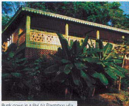
Bunk down in a Bel Air Plantation villa.