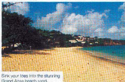
Sink your toes into the stunning Grand Anse beach sand.

When you're fully waterlogged, there's plenty to keep you occupied on land. Chill on the famous three-kilometre-long picture-perfect Grand Anse, one of over 40 white sand beaches dusting Grenada's coasts. With year-round average daytime temps of 30°C (22°C at night), you'll look native in no time. And, since one-sixth of Grenada's 440-square-kilometre